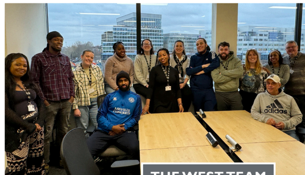
THE WEST TEAM