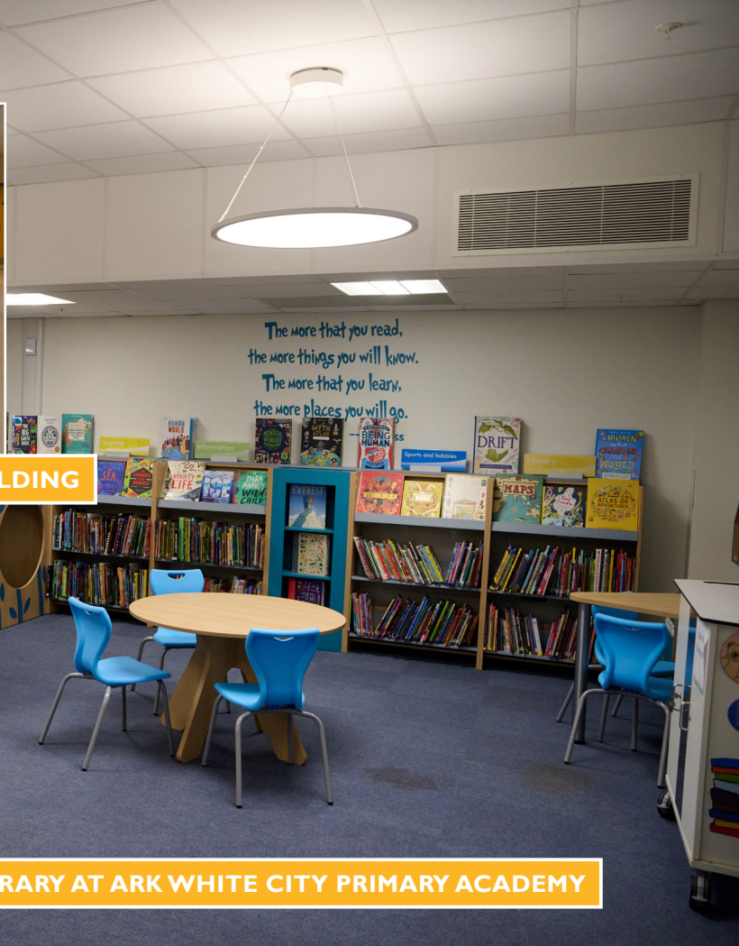
THE LIBRARY AT ARK WHITE CITY PRIMARY ACADEMY