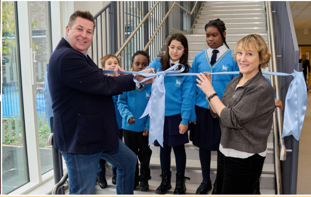
RIBBON-CUTTING AT THE NEW SCHOOL BUILDING