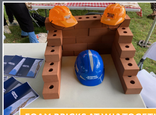
FOAM BRICKS AT W12 TOGETHER

In addition to working with schools, B+K has been actively supporting the community. They attended the W12 Together Community Festival and brought foam bricks for kids to play with. They were thrilled to see some pupils from Ark Swift Primary who recognised them! They have also recycled a large fridge from the existing Ark Swift site and donated it to West London Welcome, a refugee centre where they have previously done work.