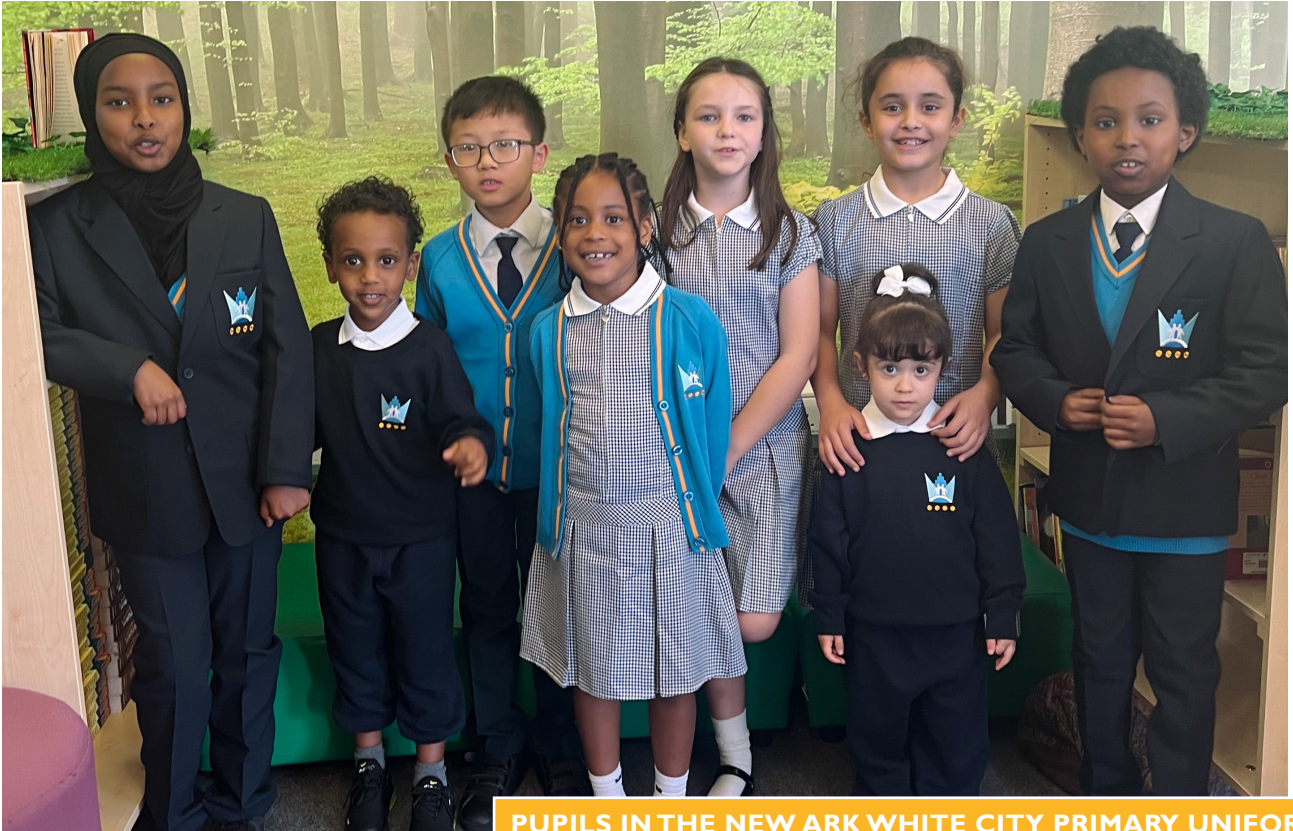
PUPILS IN THE NEW ARK WHITE CITY PRIMARY UNIFORMS