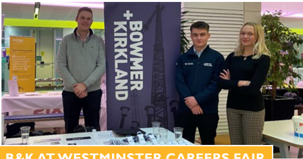
B&K AT WESTMINSTER CAREERS FAIR