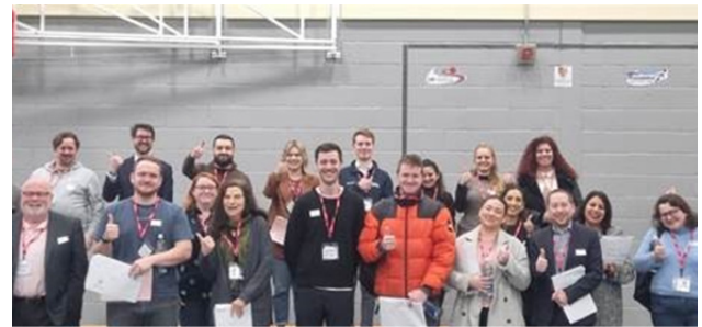
SALVATORIAN COLLEGE MOCK INTERVIEWS