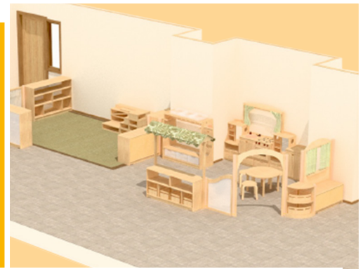
SECTION OF RECEPTION CORRIDOR

Ark White City Primary is excited to be working with Community Playthings, a furniture company who are designing items for our classrooms that will maximise learning through play. Founded in the early 1940s, Community Playthings uses renewable resources like wood, which are sustainable and safe for children to play with. We can't wait to see these finishes in our new space.