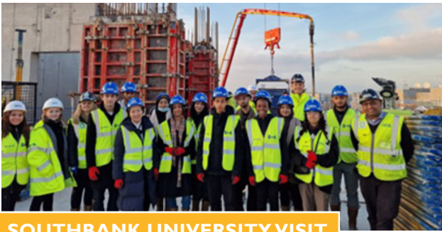
SOUTHBANK UNIVERSITY VISIT

B+K have been working with Construction Youth Trust to support six young people interested in starting their career in the industry including interview advice and practical workshops.